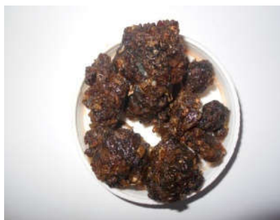
Fig. 4. Guggulu Plant Guggulu Plant and Resin of Guggulu