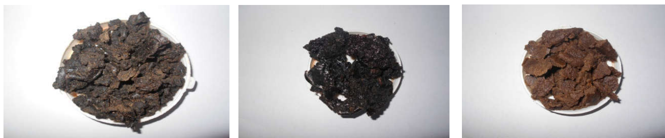
Fig. 5. Shuddha Guggulu by Guduchi Kwatha Fig. 5. Shuddha Guggulu by Triphala Kwatha Fig. 6. Guggulu by Godugdha