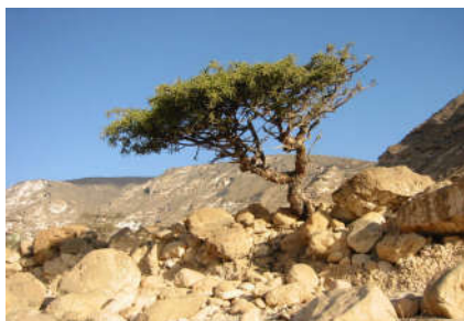
Fig. 1. Guggulu Plant