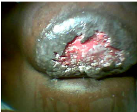
Figure 2. KA underlying the gluteal skin

On his left gluteum, he had an ulcerated lesion that was undermining and raising the margin of the ulcer. The cleft area was clear. The wound had a foul smelling discharge. It was however, not painful. The facial skin and gluteal skin looked dimpled. Although clinically HIV infection was suspected, the patient declined to undergo the Test.