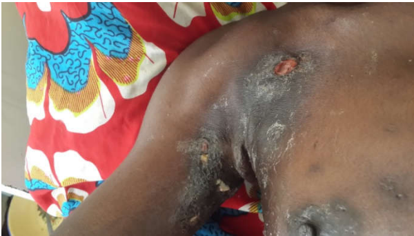
Figure 8. Case 2 KA Lesions in Rt axilla