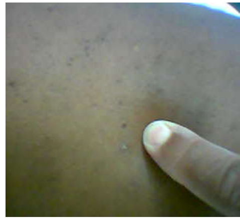
Figure 4. Dimpling KA on the body