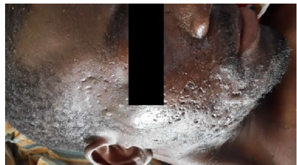
Figure 6. Case 2 KA Lesions on Face