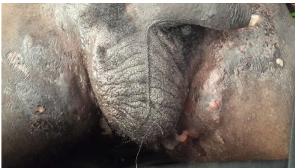
Figure 10. Case 2 KA Lesions on both thighs