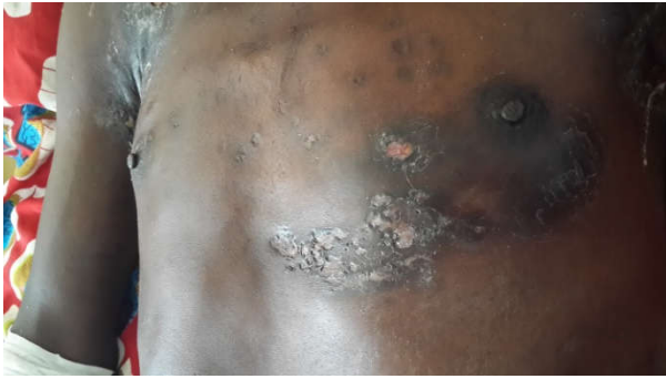
Figure 7. Case 2 KA Lesions on chest