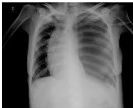
Gas under Diaphragm