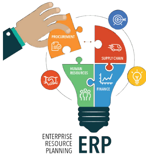
Fig. 1. Enterprise resource planning (ERP) is business process management

(PPMPS), developed and validated by Demo (2008), with 19 items distributed across 4 factors and presenting Cronbach's alpha above .70.