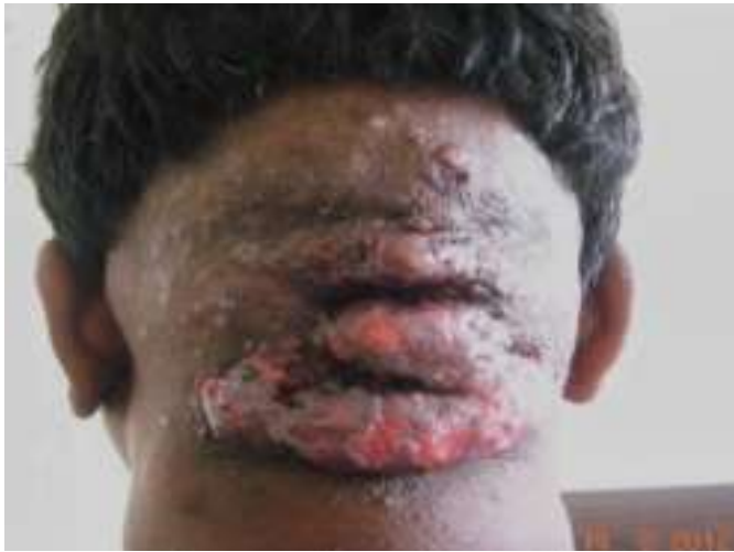
Figure 1. Case 1. Preoperative photograph