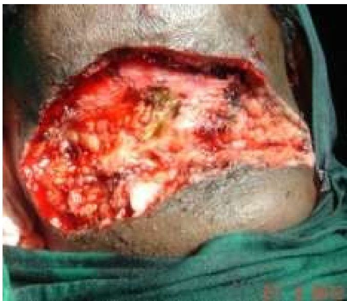
Figure 2. Case 1. Excision was performed in a horizontal elliptical fashion