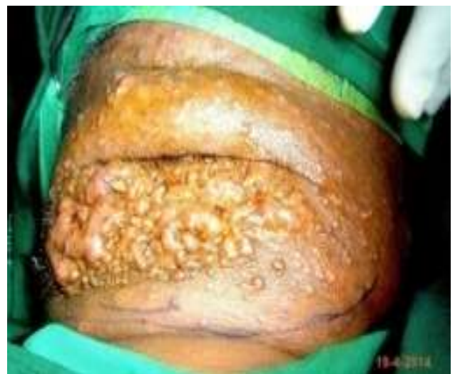
Figure 6. Case 2. Preoperative photograph