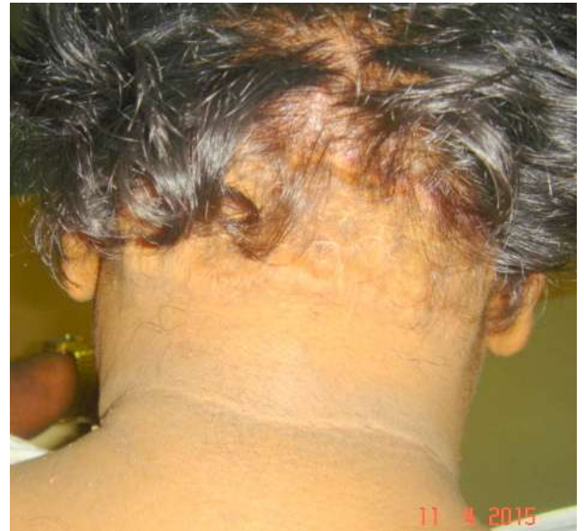
Figure 10. Case 2. Postoperative photograph after 1 year

Bazin in 1872 first named this lesion as Acne Keloidalis (Cosman and Wolff, 1972). This idiopathic inflammatory condition is most commonly seen in young African-American men after puberty, representing approximately 0.45 percent of all dermatoses affecting African Americans. (Ogunbiyi and George, 2005) The male-to-female ratio is approximately 20:1, and these cases are rarely reported in women (Dinehart et al. , 1989). The cause of this lesion is unknown and is not a true keloid and has no relationship with Acne Vulgaris. Many have proposed an etiology similar to that of pseudofolliculitis barbae, implicating the action of hairs curving into the skin leading to a foreign body inflammatory reaction (Kelly, 2003). Close shaving of hair in the low neck area with the curved, coarse type of hair that is typically seen in black patients has been proposed as an etiological factor in 90 percent of AKN cases (Salami et al. , 2007). But such an appearance is not seen in our patients.