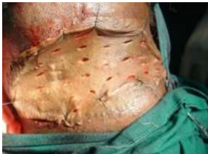
Figure 3. Case 1. The raw area was covered primarily by single sheet of meshed split skin graft of medium thickness