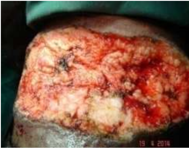
Figure 7. Case 2. Defect after excision