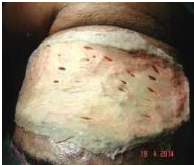
Figure 8. Case 2. The raw area was covered primarily by single sheet of meshed split skin graft of medium thickness