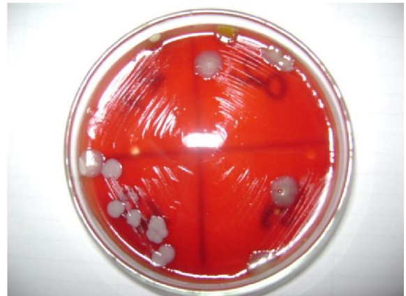
Figure 1.1. Colony forming units of Staphylococcus sp in sheep blood agar, Mocambo Settlement

Staphylococcus sp as one of the main causes of subclinical mastitis in goats. Langoni et al. (2006) examined 124 samples of goat milk, from 62 lactating Saanen, Alpine and Pardo Toggenbourg goats with subclinical mastitis in Botucatu, São Paulo. In pure culture the authors found predominance of Staphylococcus epidermidis with 55%, 12.8% with Staphylococcus aureus and Streptococcus agalactiae with 10.1%, similar to what we have found, and Candida albicans with 6.4%, Corynebacterium bovis with 5.5%, Pasteurella multocida , 4.6% and in smaller percentages Bacillus spp 2.8%, Escherichia coli , 1.8% and finally with 1.0% Acinetobacter calcoaceticus .