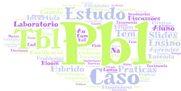
Figure 3. Word Cloud (Active Methodologies)

classes based on Active Methodologies, the question was left open and the answers were also categorized in Word Cloud (Figure 4):