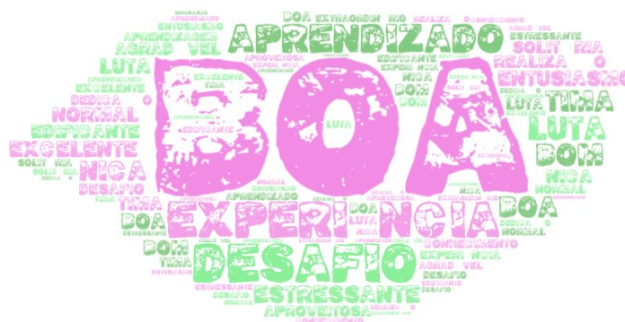
Figure 4. Word Cloud (Sensation Active Methodologies)

Based on what can be seen in the cloud, it is possible to affirm that the students consider that the experience with the use of Active Methodologies is good, challenging and brings learning. The word experience appears prominently, because it was inserted in the question; Words such as: struggle, excellent, great, in addition to the word stressful, which also appear with some prominence, also call attention.