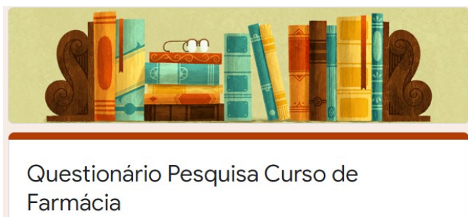
Figure 2: Questionnaire implemented in Google Forms

From the students' answers to the questions, graphs were generated in order to facilitate the analysis of the answers obtained. The analysis of the collected data indicates that, regarding the age profile, the respondents are mostly students who are directly entering high school and are between 17 and 20 years old, therefore, quite young. As for the Pedagogical Project of the Course and National Curricular Guidelines, the data revealed interesting information. Most strongly agree or agree that the methodology developed by the teachers integrates theoretical and practical knowledge. Regarding this same question, it was possible to verify that there is a portion of students, who declare themselves neutral, that is, they neither agree nor disagree with the fact that during classes they actively participate in the process of construction and dissemination. Knowledge that teachers address. Thus, it can be said that these students, even though they consider that the methodologies integrate theory and practice, are not always fully aware of their role in these proposals. When asked which Active Methodologies are applied in the course, it was left open. The responses were categorized by Word Cloud (Figure 3).