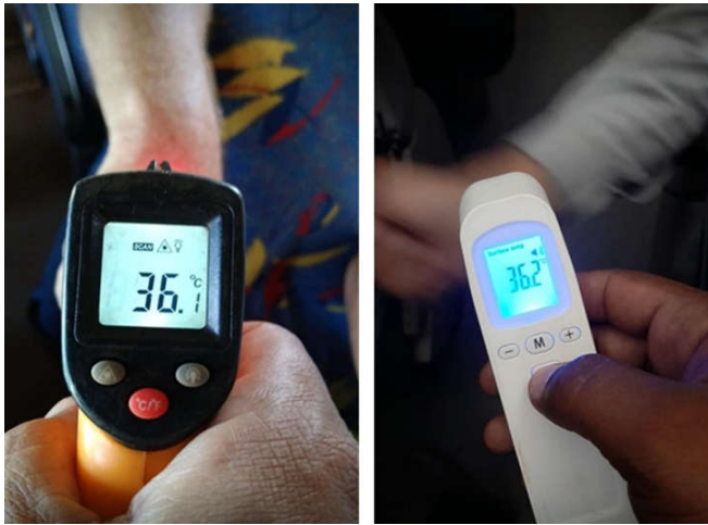
Figure 5. Measurement of passenger body temperature with digital thermometers

If a possible suspicion of COVID-19 is identified, that is, passengers with a body temperature above 37 °C, some measures are important to be taken in order to protect other passengers. Passengers identified with symptoms of fever will be sent to a specialized health unit closest to the embarkation point for rapid testing of COVID-19 and, if not, their ticket will be rescheduled at the next available time. If the test shows a positive result, the passenger will undergo treatment at home, respecting social isolation, retaking the test after 15 days of starting treatment. After this period, if the retest is negative, it will be able to board and carry out the trip respecting the safety criteria.