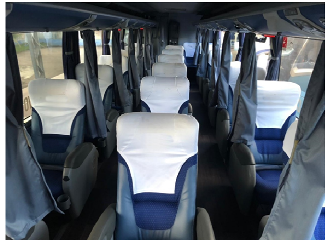
Figure 2. Armchairs distributed in rows with three individual seats

distancing (Figure 3). The curtains were made with material based on flexible PVC laminate, which facilitates cleaning and eliminates the possibility of propagation of droplets between the seam holes.