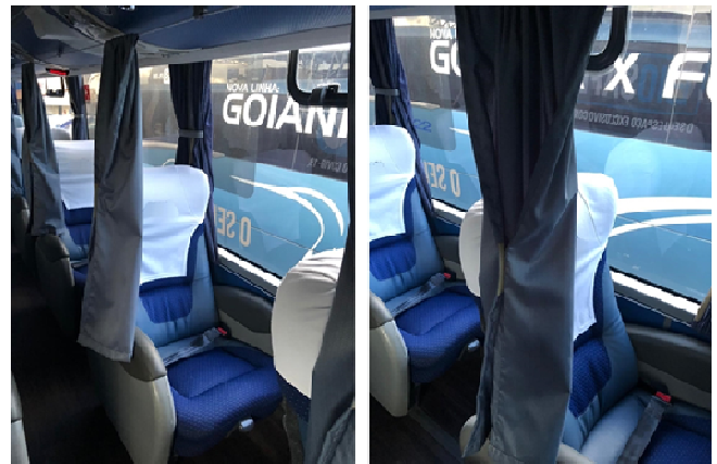
Figure 3. Antimicrobial curtains between the seats

Environment disinfection: To meet the criteria for disinfecting environments, the biosafe system introduced ultraviolet light (UVL) technology for disinfecting toilets (Figure 4). The system consists of a set of ultraviolet luminaires that are activated automatically after using the toilet.