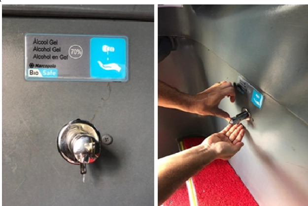
Figure 1. Containers for storage and with gel alcohol dispenser

Sanitization of hands: Using the biosafe system, storage containers and an alcohol gel dispenser were installed. These were installed near the bus access door (Figure 1). The activation is performed manually, allowing for safe, quick and easy hand hygiene, before and after each trip.