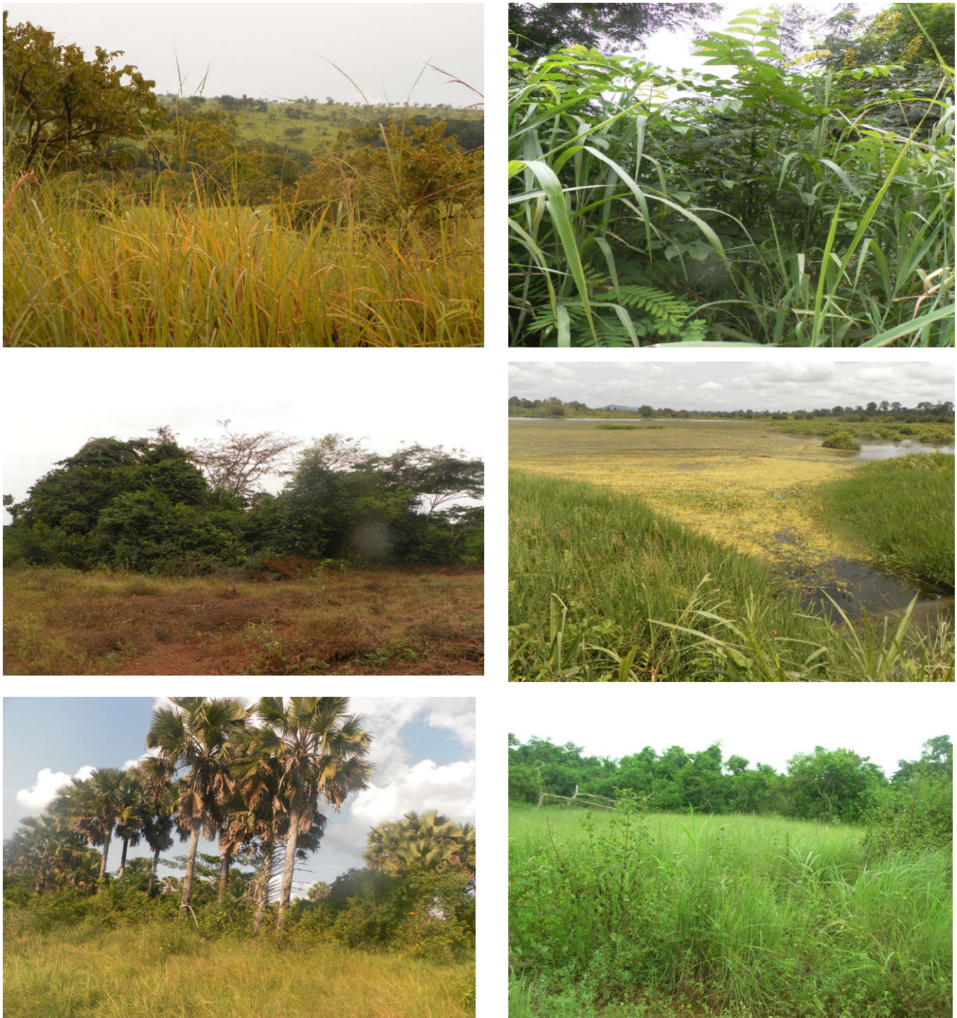
Figure 2. Different Landscapes Around Study Sites: (a, b) Savannah; (d, f) pre-forest savannah; (c, e) Anthropogenic disturbance

This result is different from those of most authors who note a predominance of trees and shrubs or herbaceous plants (Yédomonhan et al. , 2009; Lobreau-Callen and Damblon, 1994; Dongock et al. , 2004; Yédomonhan, 2004; Iritié et al. , 2014; Coulibaly et al. , 2019). The floristic differences between ecosystems reflect this inequality in composition. Furthermore, according to (Mc Telleria, 1993), the interzonal (spatial) diversity of honey plants is due to the preference of honey bees. This selection of melliferous species by bees is influenced by the floral morphology, phenology and floristic composition of the environment (Lobreau-Callen, 1994; Macumu et al. , 2015). Bees produce honey for consumption by their colony. The flowers give off various aromas depending on the species.