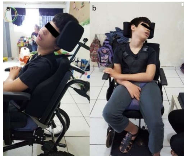
Figure 1a: Front view

aspects, he has a hypotonic tone and a wheelchair (Figure 1a - 1b).