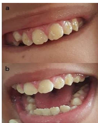
Figure 4a: The use of 0.12% chlorhexidine digluconate Figure 4b: Presence biofilm

In the assessment of orofacial myofunctional functions, the following were observed: open lips, lack of lip sealing, hypotonicity of the upper and lower lips, malocclusion (Figure 3a). Regarding stomatognathic functions, she breathes through the mouth, dental clenching and bruxism, altered tooth eruption sequence and chronology. In the intraoral evaluation, there was the presence of gingival bleeding through brushing and probing, without the presence of a periodontal pocket, brownish pigmentation of the teeth due to the use of 0.12% chlorhexidine digluconate (Figure 4a), with the presence of excess biofilm, chronic caries in teeth 75 and 85, stationary caries was found due to the use of cariostats.