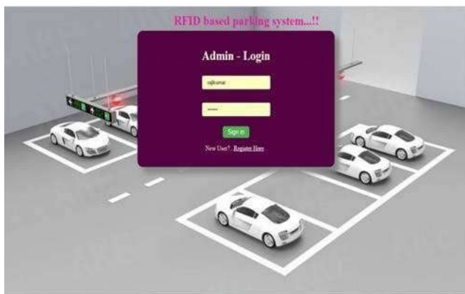
Fig. 1. Admin Login Page