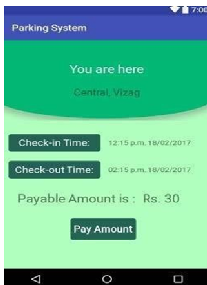
Fig. 7. User Check-out Page