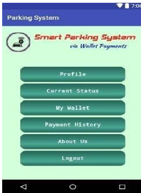
Fig. 5. Home Page of User