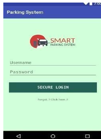
Fig. 4. User Login Page