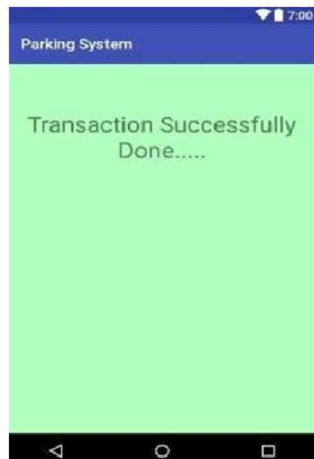
Fig. 8. Transaction Status of User