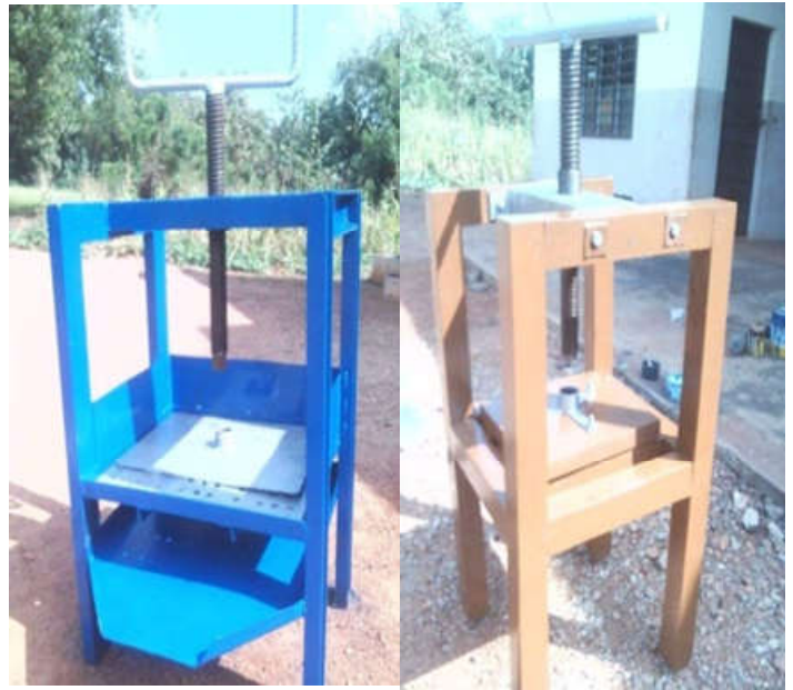
Figure 2. Manufactured press