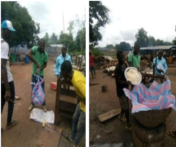
Photo 2. Bagging and weighing of cassava pulp