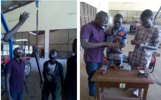
Photo 1. Measurement of the screw rod and wiring of the electric meter

locating a manufacturer of Gari and in carrying out the configuration operations under real working conditions. During this third phase we got closer to the manufacturer of Gari in Kétou in the department of the plateau in Benin. The manufacturer of Gari allowed us to have access to the cassava pulp samples and to work in real conditions. We took four samples of cassava pulp which we bagged and weighed. Then we used the dynamometer to have the same torque of clamping forces for each of the presses. Finally, when we noticed that the water no longer came out of the sample bag of pressed cassava pulp, using the stopwatch, we measured the duration of pressing of pressed cassava pulp. Photos 1, 2 and 3 below show these operations.