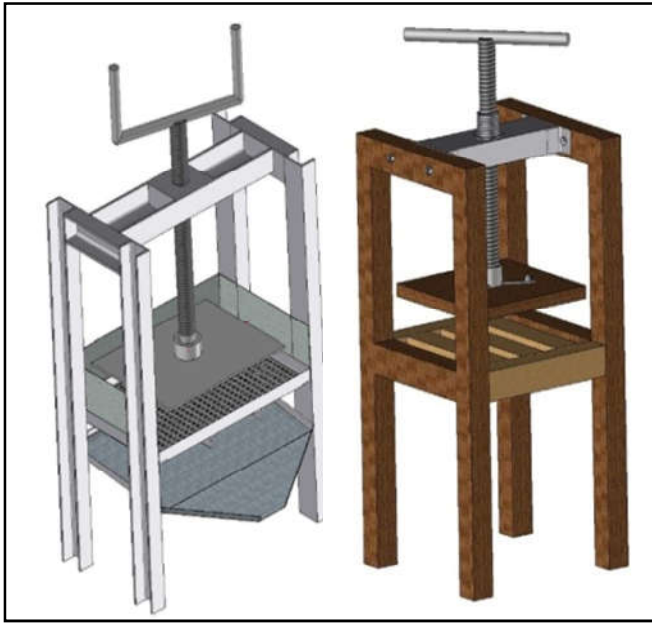
Figure 1. Conceptual press