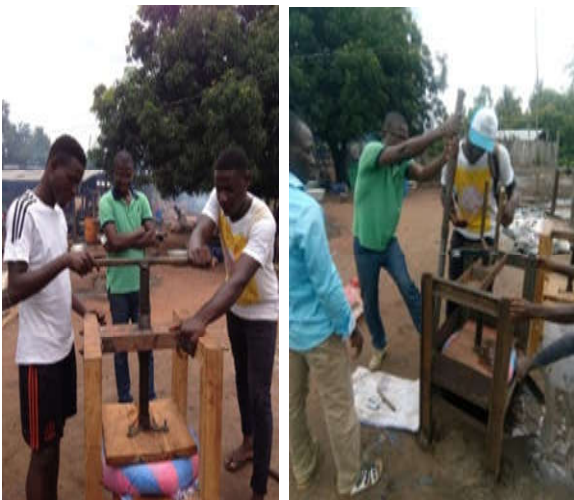
Photo 3. Pressing the cassava pulp with the two types of press