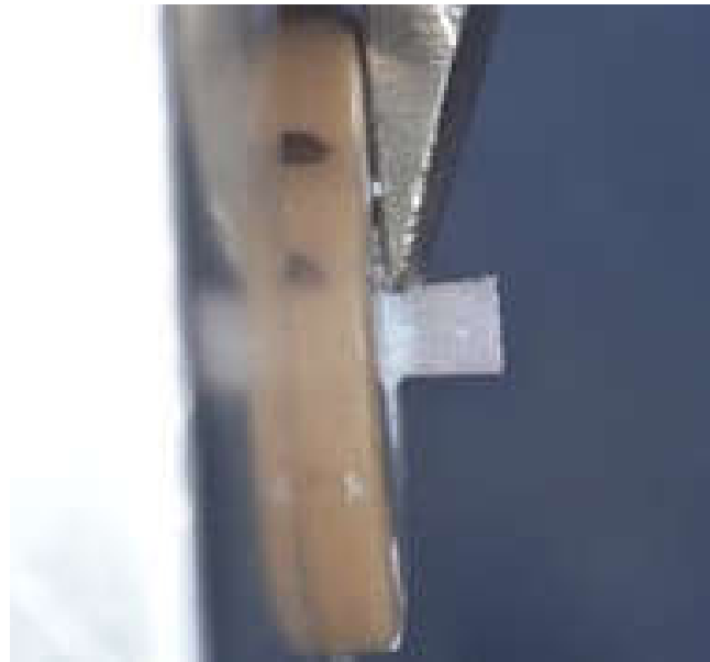
Figure 1. Shear testing